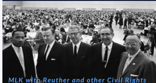
MLK with Reuther and other Civil Rights Leaders at Detroit's Cobo Hall in 1962

ON JANUARY 20TH, WE CELEBRATED MARTIN LUTHER KING JR. DAY, ONCE AGAIN REMEMBERING THE CIVIL RIGHTS LEADER AND VOCAL ADVOCATE FOR THE LABOR MOVEMENT.