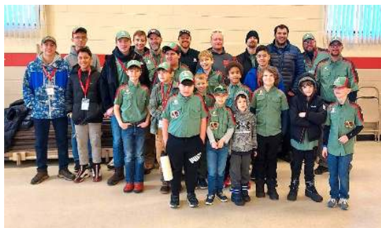
Troop of IL 2237 Troop of Trail Life USA