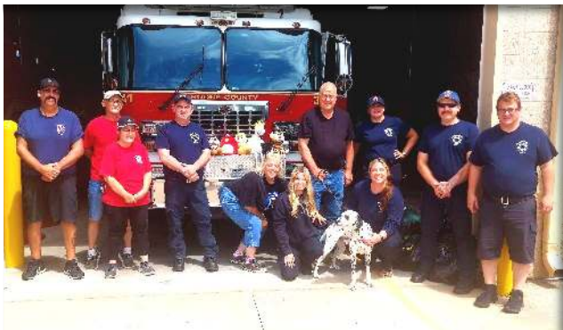
Boone County Fire Department, District 2