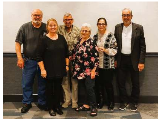
Retirees from Local 1268 joined other UAW local retirees at the banquet.