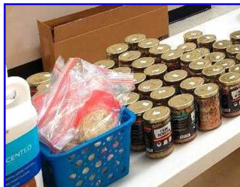
Pet Food donated for in 2023.