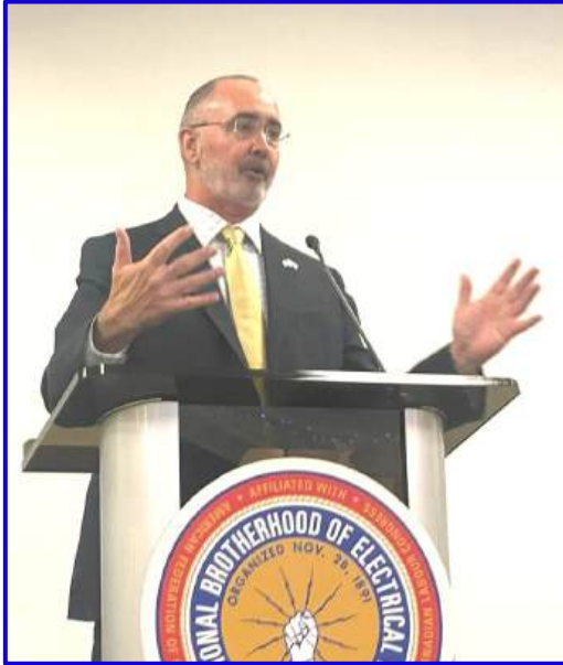
International President Shawn Fain was the Speaker of Honor at the banquet.

Rockford United Labor (RUL) held their fifth Annual Labor Recognition Banquet at the IBEW 364 Union Hall on Saturday night. RUL represents more than 50 local unions with over 30,000 unionized workers in Winnebago, Boone, Stephenson, Ogle and Lee counties.