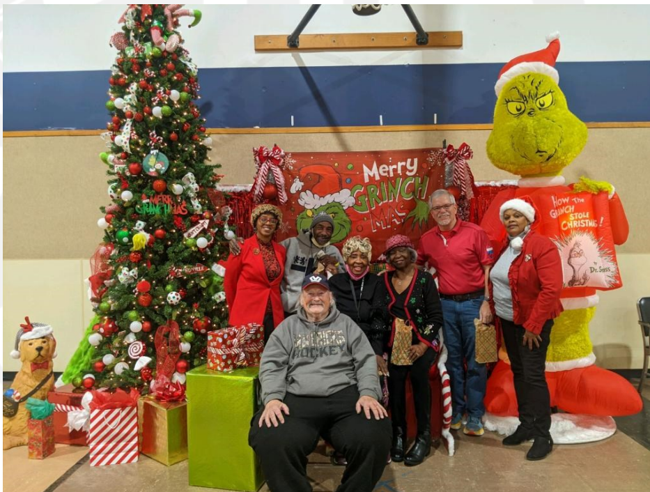
Retired members pictured at the December Christmas Meeting ❄️