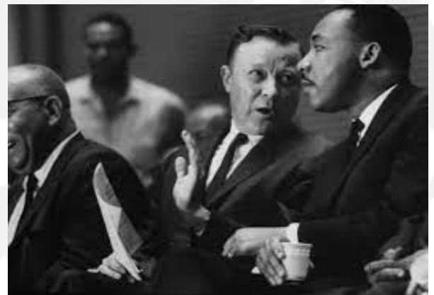
Martin Luther King Jr. Pictured with UAW president Walter Reuther

These are just a few examples of the many groups that benefit from Civil and Human Rights. By protecting the rights of all individuals, we can create a more just and equitable society for everyone.