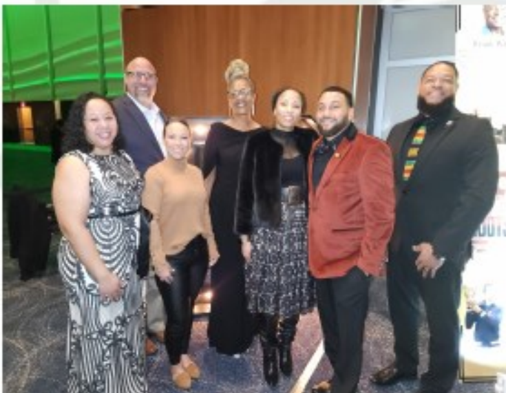
Pictured at a recent CCDCC event are members of UAW Local 31, and Local 249.

The Clay County Democratic Central Committee is a division of the Missouri State Democratic Party. The purpose of the Central Committee is to promote the general welfare of, and provide leadership for, the Democratic Party of Clay County. The CCDCC works to elect or appoint Democrats to public office, provide appropriate services and support to Democratic officials, clubs, and individual members of the Democratic Party.