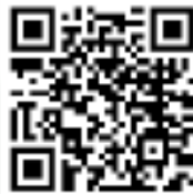
Kansas Voter Registration