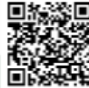
Missouri Voter Registration

Online: By the 4th Wednesday before Election Day.