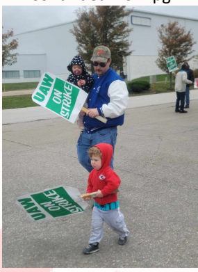
Teach them young!

couldn't take cash so if you go or want to send supplies, send or bring the supplies. They need diapers, food for the pantry, baby wipes, razors and basic grooming equipment. But I think seeing us down there showed them that they are supported by other brothers and sisters, and that is something I really do think they need. As I said in the beginning, I think the four of us had felt very disconnected and aimless because we aren't out on the frontlines the way we were in the past. But we did feel more connected on the drive home from there. I think the people out there appreciated our trip out to walk with them. I think we are all ready to get back to regular life but I really do think we need to get as much back as we can before we go back because the optimism is really high on this contract. And the people out there are feeling the same. No one likes to strike. But I think all of us feel unappreciated for the work we do that is making lots of people rich. I think we all just want them to get rich from production and not in gutting our livelihoods to do it. If you decide to make the trip to Wentzville get with 31 Presi-