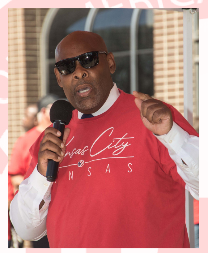
KCK Mayor—Tyrone Garner