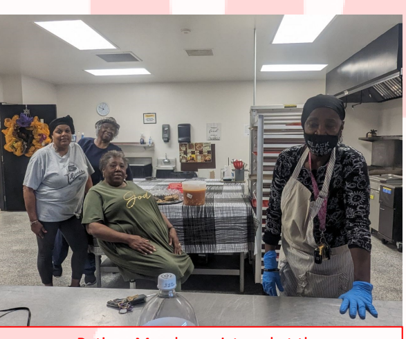
Retiree Members pictured at the Day of Caring Event at the Hall

Hello Sisters and Brothers, Happy October! Looks like autumn is finally here. Who doesn't love be beautiful colors of fall?! We had such a fun day in Warsaw recently. From