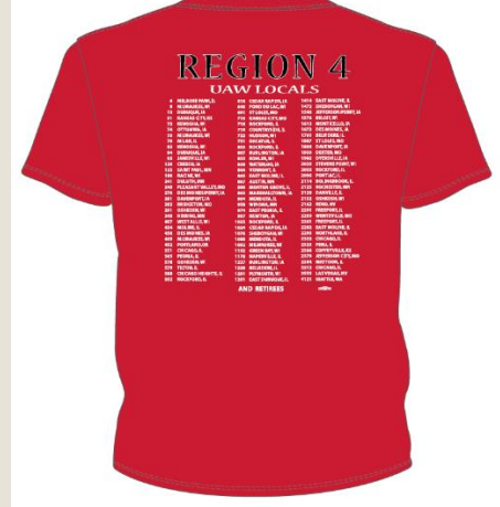
Back side: All Region 4 Locals and Retirees